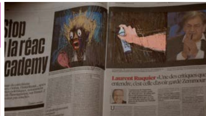
(c) AUTOUR DE MINUIT PRODUCTIONS / Donato Sansone

An artistic improvisation in real time led day in and day out, inspired by international events as taken from the pages of the French daily newspaper Libération.